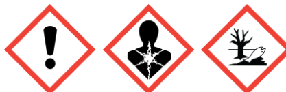
GHS07 GHS08 GHS09